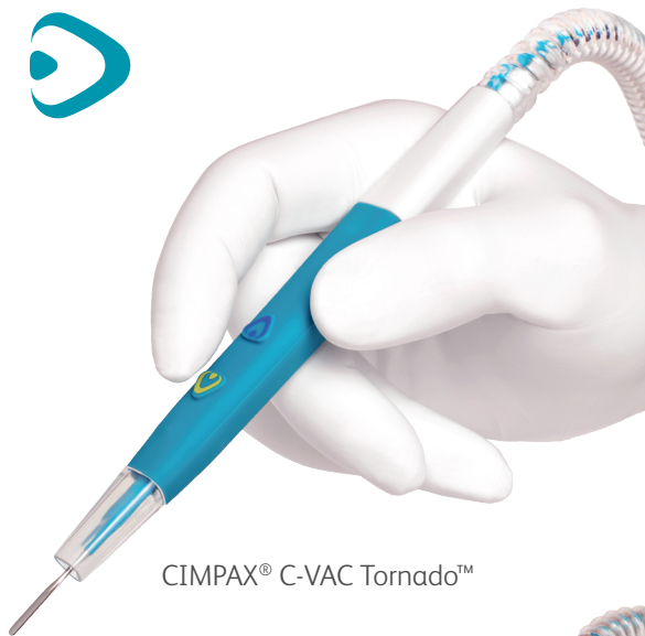
CIMPAX® C-VAC Tornado™