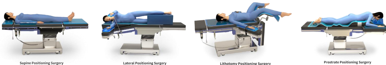
Supine Positioning Surgery