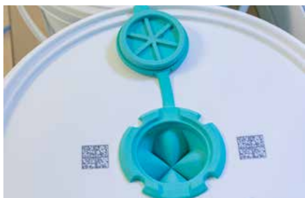
Quadricuspid valve during operation

UltraSAFE buckets are available in three standard sizes; 1, 3 and 5 liters. All buckets have, built-in to the lid, an exclusive quadricuspid valve. This valve is specifically designed to prevent the escape of formalin fumes during operation and, at the same time, allows for formalin dispensing using UltraSAFE's automatic filling. An additional cap attached to the valve seals the bucket for extra safety during transportation. On the bucket's lid, a unique 2D barcode ensures biospecimen traceability. The UltraSAFE software can be used to associate this 2D barcode with the biospecimen ID number for full patient safety.