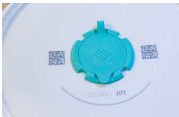
Closed quadricuspid valve during transportation and storage